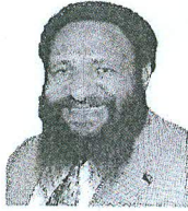
Hon. Don Pomb Polye, MP Member for Kandep Open