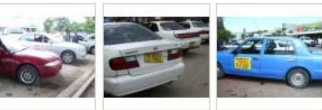
ICCC – Friend to Business, Friend to Consumer

At the end of the grace period the Commission, in conjunction with the Department of Transport and other relevant enforcement agencies will take appropriate actions necessary to ensure that all taxi owners and operators comply with this requirement.