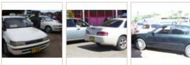
ICCC – Poroman long Bisnis, Poroman long Konsuma

ICCC i tok strong olsem bihain long nambawan dei bilong mun Jenuari 2009, sapos ol teksi i no igat teksi mita bai lo i holim pasim ol. Olsem na olgeta papa bilong ol teksi mas harim na bihanim dispela toksave.