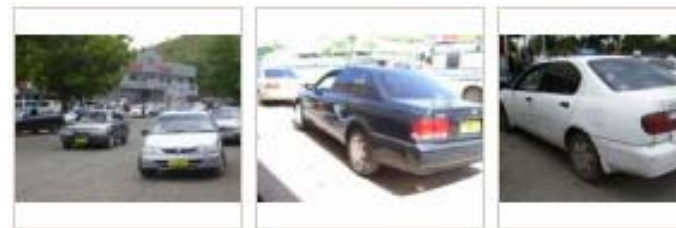
ICCC – Bisnis ena Turana, Konsuma ena Turana

ICCC ia ura be inai nega sisina lalonai, teksi mita ia noho lasi teksi biaguna bona aheau taudia be umui lao Dick Smith Electronics, POM dekenai emui teksi mita umui hoia.